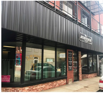
237 Second Street Owner: Adrian Justice Lower & upper available for rent