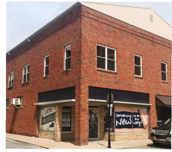
210 Second Street Owner: Holt & Candi McGee Built to suit