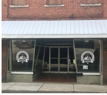
225 Second Street Owner: Harriett Blanton 7,000 sq. ft. lower - 7,000 sq. ft. upper.