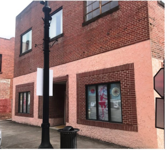
223 Second Street Owner: Brewer Family Lower level